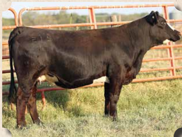
WEIS Miss Ruby 215J | Donor dam of lot 10 embryos