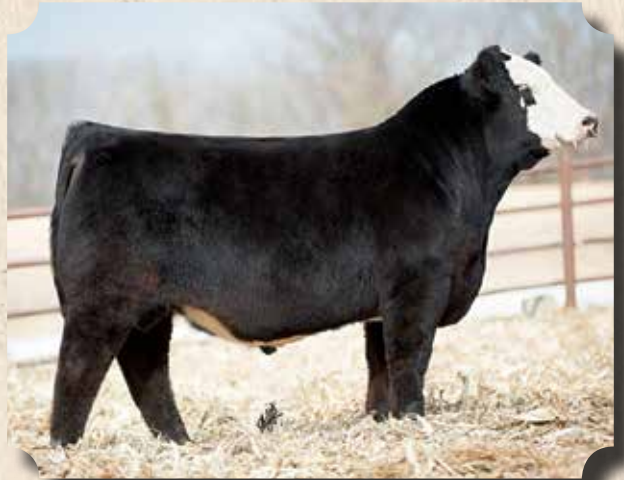
LLSF Excess Cash E906