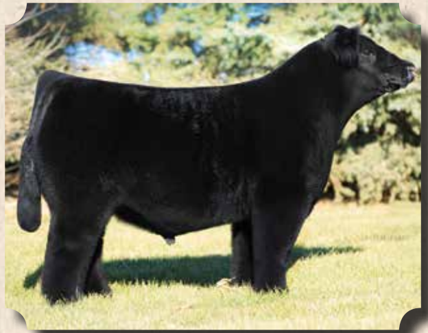
Wynne In Doubt

Sire of lot 45 & a very popular club calf sire.