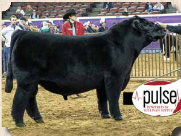
TSSC BT Limit Up 1099J ET | Sire of lot 10 embryos