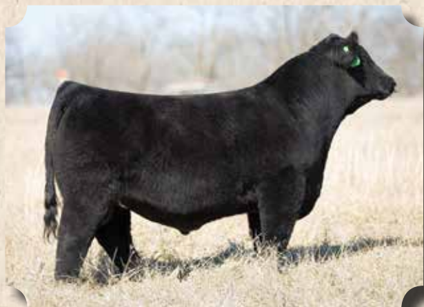
LLSF Game Point G929 Sire of many lots selling